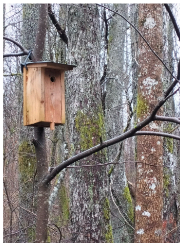
Helping Nature is Helping Us